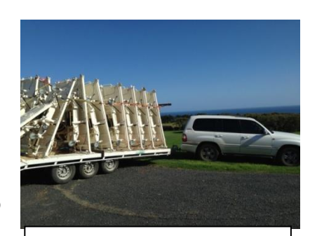
Beds from RC Traralgon en route to DIK and then the Philippines

Donations In Kind national activity results for last year have just been released and everyone who has been involved deserves a pat on the back. Clubs from all Victorian Districts were involved in some way and many thousands of people now lead better lives because of your efforts. This is a great example of the power of Rotary and what we can achieve if we work together. Special thanks go to the DIK Inc Clubs who contribute one month's rent and also to PP Laurie Fisher and the volunteer team at DIK for their wonderful contribution.